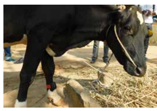
Nikkei Asia Review

'Fitbit' for cows: Indian startup tackles low dairy productivity