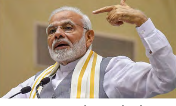
Gujarat: From Anand, PM Modi to lay 'e-foundation stone' of Amul's Kolkata dairy plant Read more