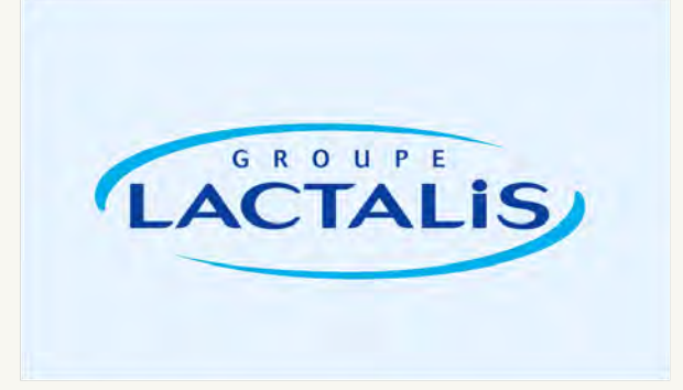
Lactalis buys Nestle's chilled business in Malaysia Read more