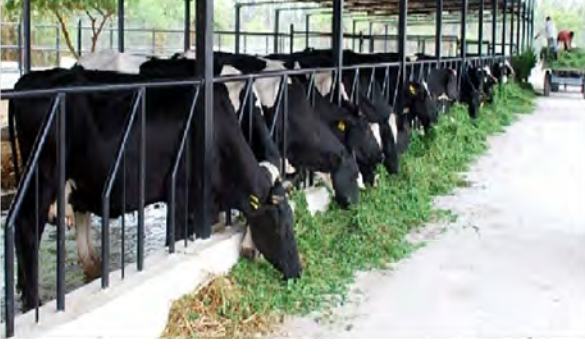
Punjab To set up modern dairy centres Read more