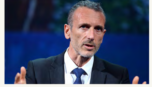
Food giant Danone is planning to become the world's largest international 'benefit corporation' by 2030 Read more