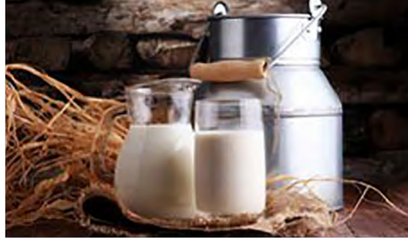
Mother Dairy Refuses to Cut Prices Despite Patanjali's Cheaper Packaged Cow Milk Read more