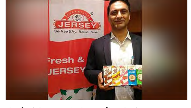
Godrej Agrovet's Creamline Dairy on expansion mode in TN Read more