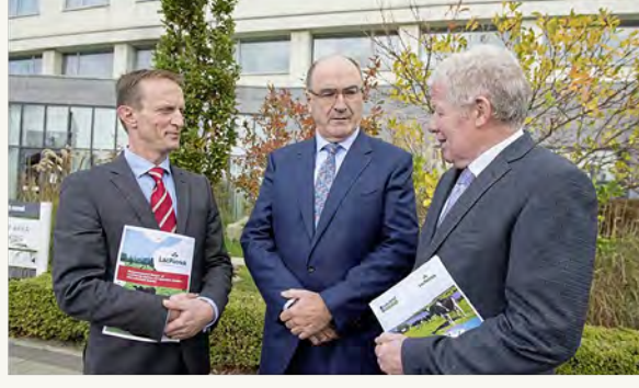
Dairies merger will create €1 billion co-op 'and boost milk price' Read more