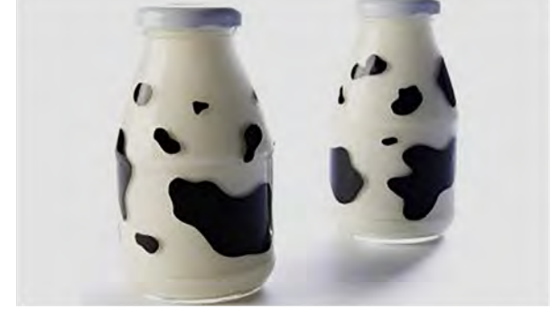
Dairy Sector Development Vital Farmers' Prosperity, Says Union Ag Minister Read more