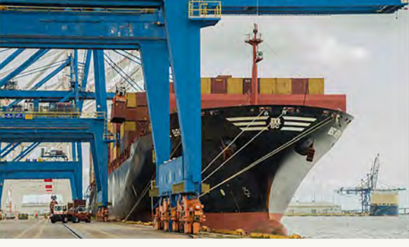
USDA Boosts Milk Production, 2019 All Milk Price Forecasts Read more