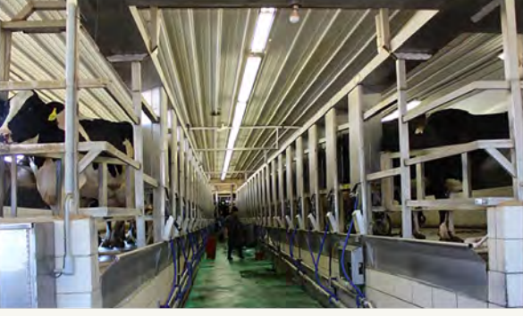
How Much Will Dairy Revenue Protection Cost? Read more